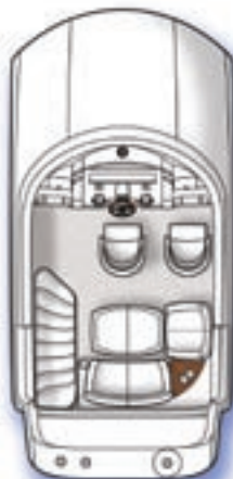
BRIDGE LAYOUT (SHOWN W/OPTIONAL TABLE)