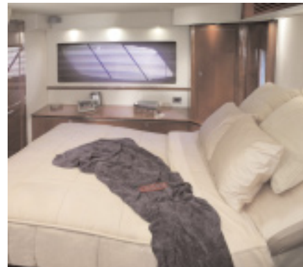
Gracious master stateroom features handcrafted wood trim, fully adjustable queen-size bed with innerspring mattress, massage function, and gas-assisted lift, extra-large windows, elegant dresser and convenient en suite dining table.