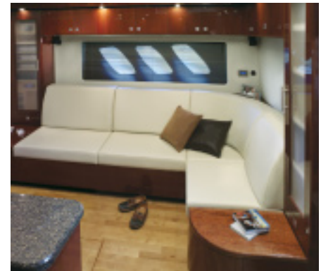
Salon styling includes glove-soft Ultraleather HP™ seating.

Sea Ray Boats, 2600 Sea Ray Blvd., Knoxville, TN 37914. For information call 1-800-SRBOATS or fax 1-636-326-3282 (USA only). Internet address: http://www.searay.com