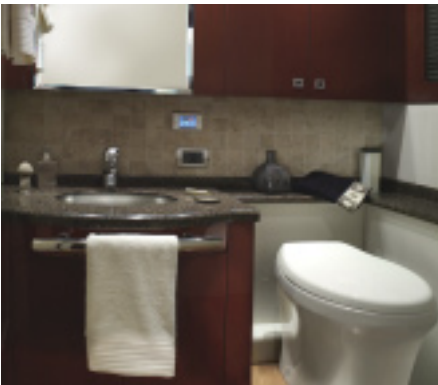
The private master head with separate shower is richly appointed with beveled mirrors, cherry-wood finished cabinetry and satin nickel accents.