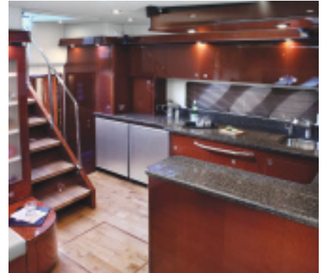
This luxuriously appointed galley features hard-surface countertops, top quality stainless-steel appliances and ample storage space for every culinary need.