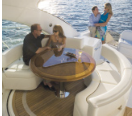
The spacious free-flowing cockpit features multi-position carousel seating, outdoor galley, grill and state-of-the-art audio/video system offering exceptional shipboard entertainment.