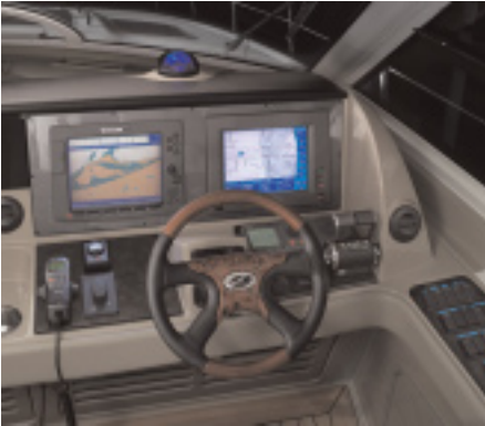
This advanced helm comes fully equipped with Raymarine® E-120 GPS/Chartplotter/Radar and Sea Ray Navigator™ III with 12.1” sunlight viewable touch-screen color display.

Our brand new “out-of-this-world” 55 Sundancer is the most amazing yacht we’ve ever built. The wow-features are endless, beginning with an upper-deck sunroom with two retractable sun roofs, teak flooring and a 360-degree panoramic view. We’ve included an elegant salon with state-of-the-art entertainment center, two luxurious staterooms and a wealth of gracious amenities throughout.